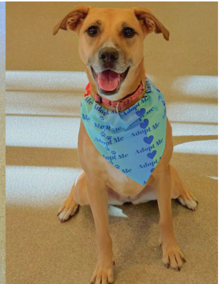
Bella 5 Years Old Cat-friendly