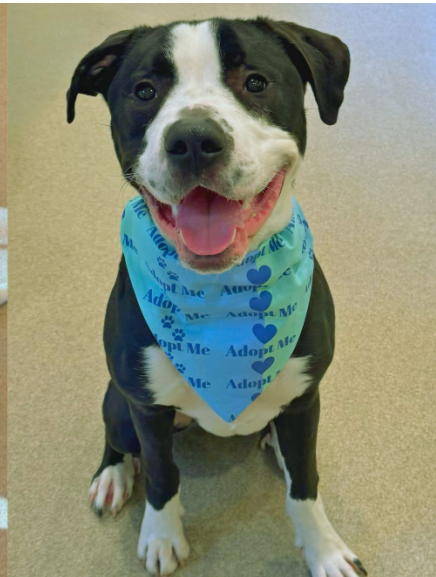
Chipotle 2 Years Old Dog-friendly