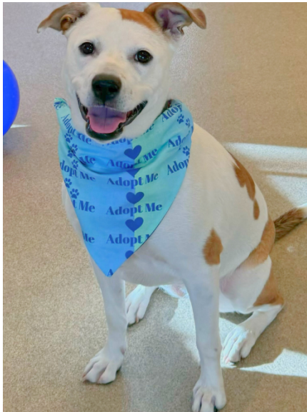
River 2 Years Old Must be the only pet in the home

Please help us do our best to get these precious, loving pups adopted by sharing with your family and friends!